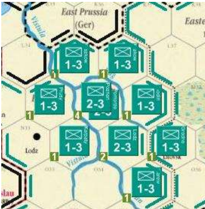
Polish Defense 1

Note that in all the diagrams in this article, the Polish air units have been omitted.