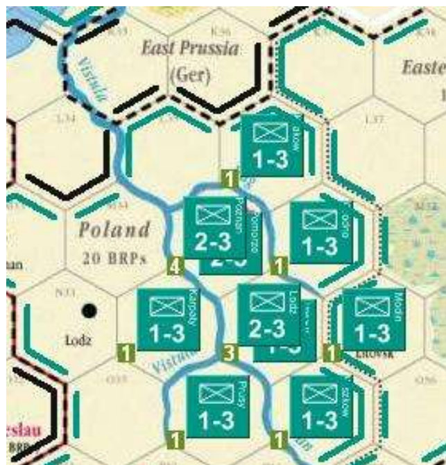
Polish Defense 4

one less overrun, Polish Defense 4 is actually slightly weaker than Polish Defense 3.