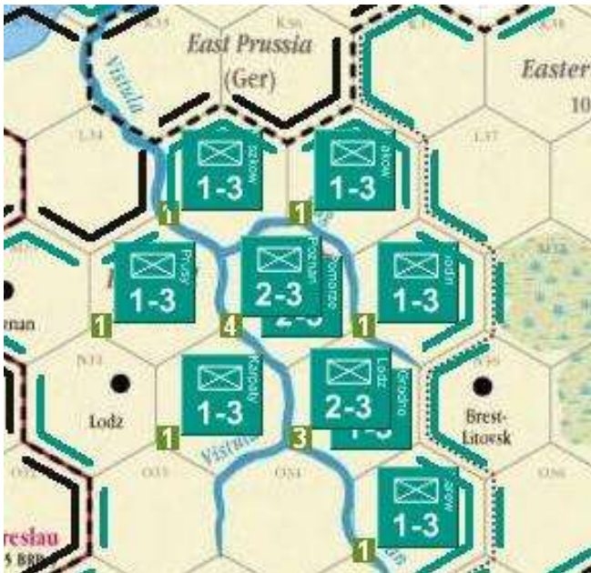
Polish Defense 2

The first variation in the Polish defense is to leave two of the hexes adjacent to N35 vacant, and put a 2-3 infantry unit and a 1-3 infantry unit in N35 itself. This is Polish Defense 2: